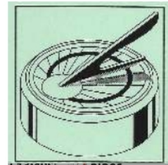
Figure 1: Crude output quality comparison via screen capture